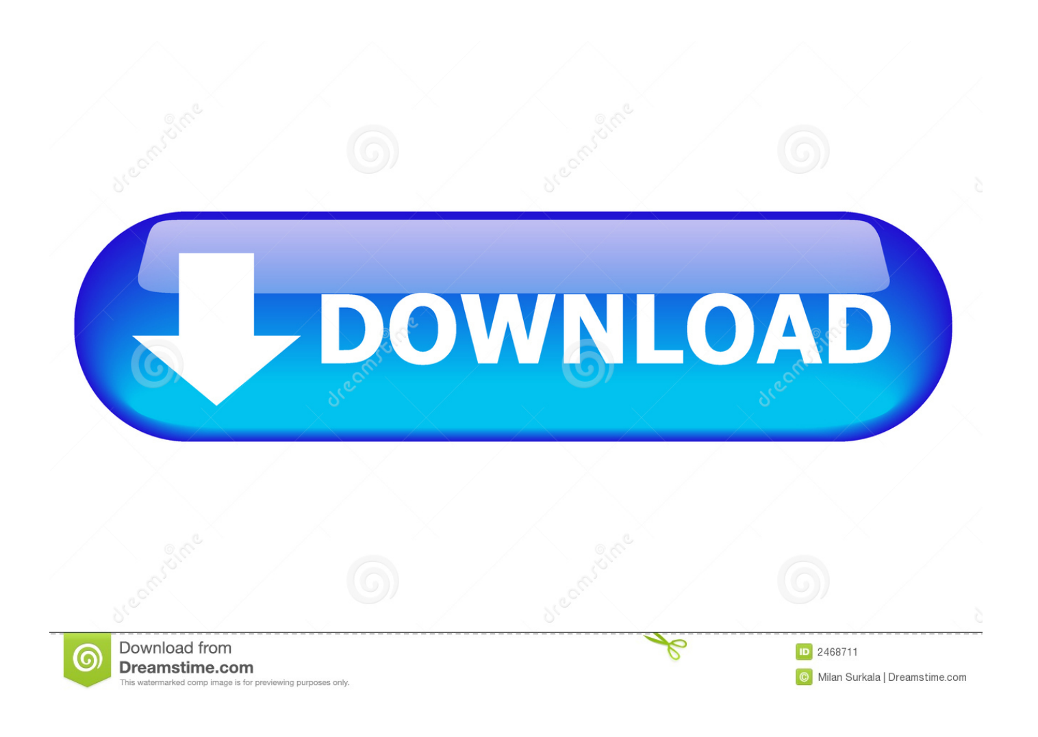
X Force X32 Exe Infrastructure Map Server 2006 Download